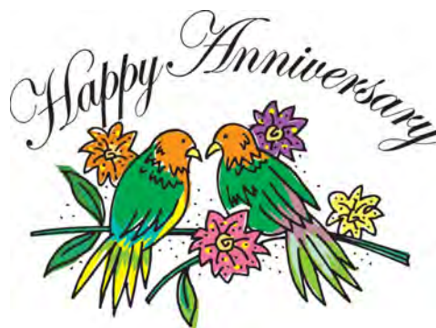
Gary and Lana Jarzombek January 10, 2004