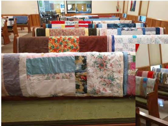
W.E.L.C.A. quilts dedicated at the service on October 24th.