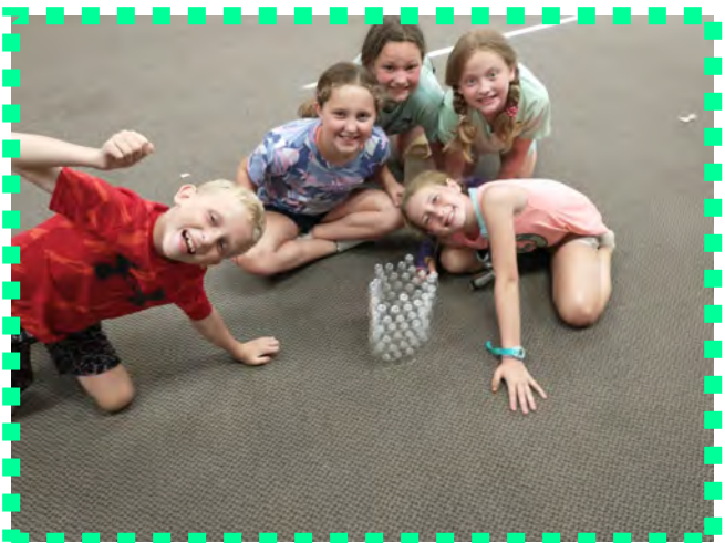
CAMPING EXPERIENCES AT CAMP CHRYSALIS