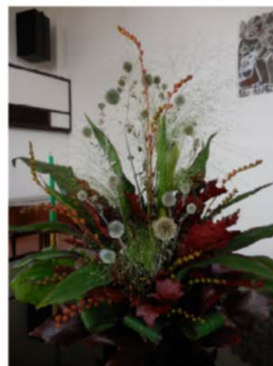
My favorite of all the arrangements (Pentecost season)

This is what you have accomplished by your support of our church’s global mission. The impact is felt in all these people, in all these ways, and in all these places. Many thanks to you and to God for the activity of the Holy Spirit in the church at all times and in all places (as we say in the Eucharistic liturgy each week). So, as the postscript says that I put at the bottom of each newsletter, you see how “your support makes a world of difference.” Although you can no longer support me, there are many others whom you can still support. To find out how to establish a new covenant of prayer, communication and support, contact 800-638-3522, ext. 2657, or go to globalchurch@elca.org .